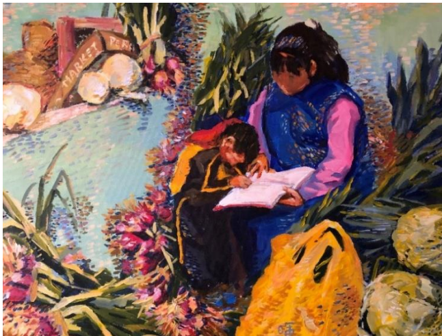
“The Peru Market”

Cusco is the ancient capital of the Inca Empire, located at a high altitude of 3,400 meters. It's a sun-drenched city rich with history and culture.