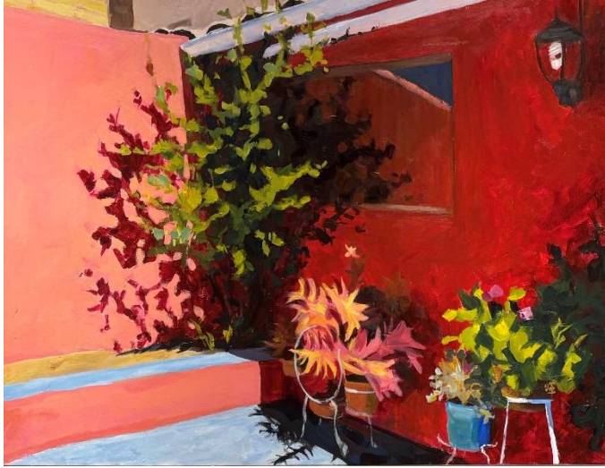
"Mi Casa Tu Casa" (Red Courtyard)