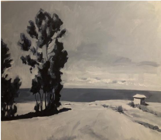
SOMETHING ABOUT PERU CULTURE, PEOPLE AND CLIMATE CHANGE