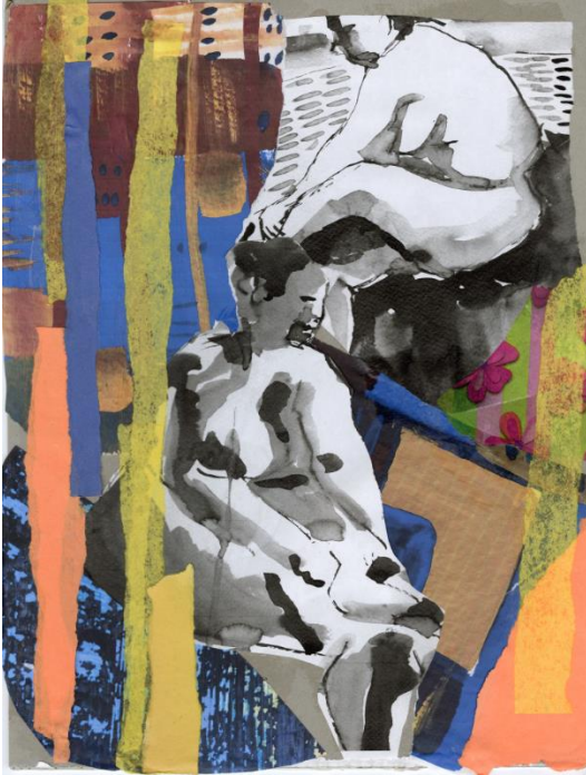
"Mother Nature in Peril_1"

Original work: Collage of ink drawings and papers, 2025