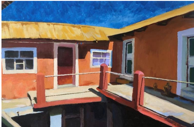
"Homestay on Amantani Island, Lake Titicaca"