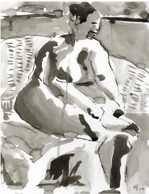
"Mother Nature in Peril_2"